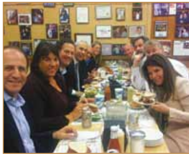
Temple Trustees take a pastrami break at Katz's Deli on the lower east side before visiting more congregations.

What do three synagogues, a JCC and a church all have in common? They are all in New York City and your Temple Board of Trustees visited each of them during a recent fact finding mission. We were interested in learning about urban congregations that had