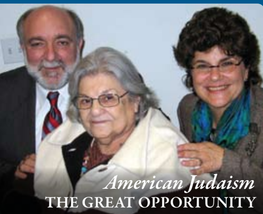
American Judaism THE GREAT OPPORTUNITY