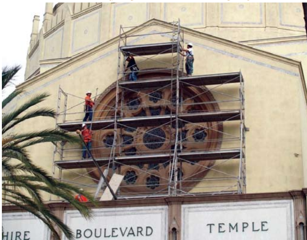
Workers erect scaffolding outside the Rose Window to begin inspection.